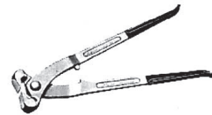
D-550 CLAMP CUTTER Part Number: 563885