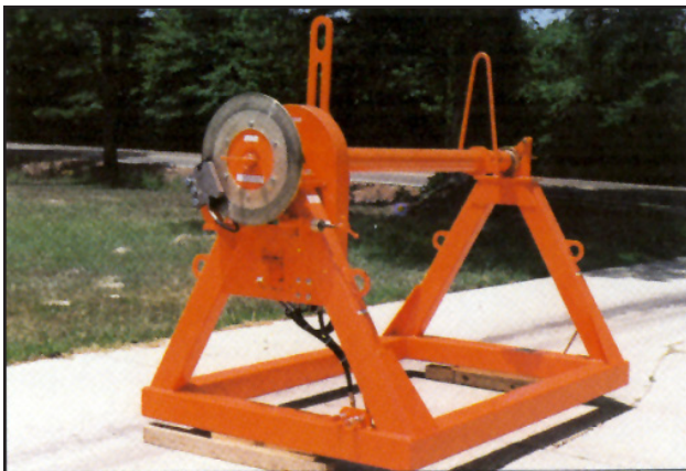
Optional Hand / Hydraulic Brake Controller

Model RS-15-96x62 with 24" Diameter Bronze Disc Brake shown with Optional Hand / Hydraulic Brake Controller and Optional Hydraulic Rewind